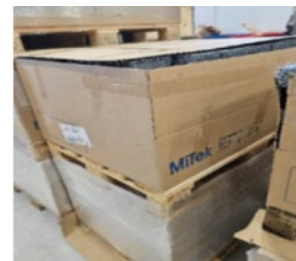
BigBox-pallet with packed bundles