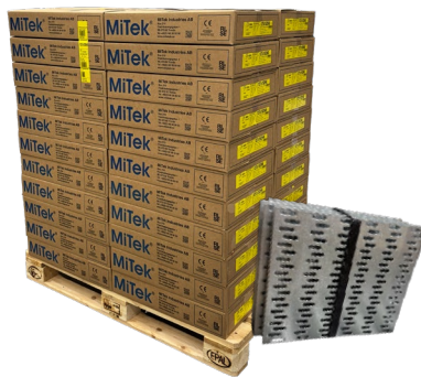
Packed bundles in boxes