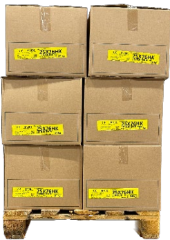
Loose-packed plates in boxes

Unit = Cardboard box Loose plates in 330mm high boxes. One pallet holds 12 boxes. Unit= Cardboard box Banded bundles packed in 110mm high boxes. Unit = Pallet Strapped bundles packed on a EUR pallet with corrugated cardboard lining. The pallet height is about 630mm which means there is room for two pallets on one pallet space.